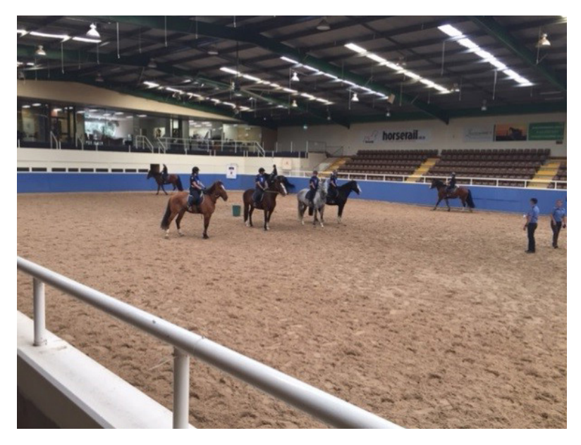
Figure 1. WA Mounted Police training

The SEC has the only indoor equestrian arena in the state with stadium seating for 1,400, VIP area and catering/bar area overlooking the arena. This makes the SEC the only facility in the state suitable to host many of the sport's championship event s and high level competitions. Many of these are qualifying events for national championships and are essential for WA riders to represent WA. Competing at the SEC ensures qualifying performances which can be compared to national qualifications, which in turn leads to national representation at international competitions.