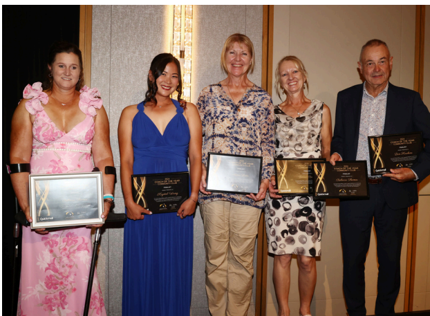
Equestrian WA Coach of the Year 2024 - Community Nominees