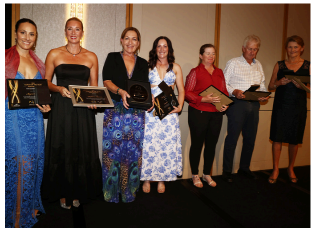
Equestrian WA Coach of the Year 2024 - Performance Nominees