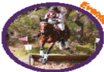
Pony Club Mount